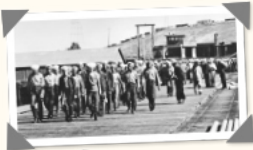
Above: Proud Black Sailors march to work at Port Chicago.

Her story is interwoven with the very fabric of the Bay Area, where history and place come together, creating a rich tapestry of experiences that continue to resonate. In this context, she remains committed to honoring that legacy while forging new paths for future generations. ■