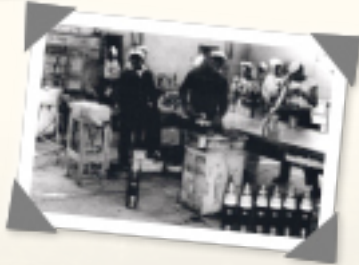
Center: Black sailors work with ammunition to be shipped from Port Chicago.