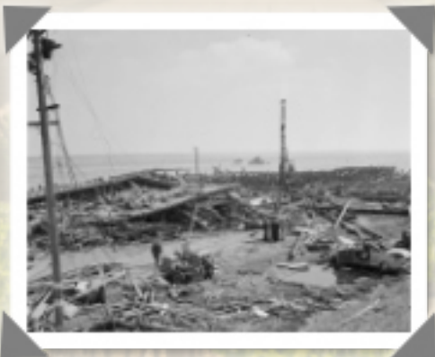
Below: Photo shows part of the devastation after the large explosions in Port Chicago.